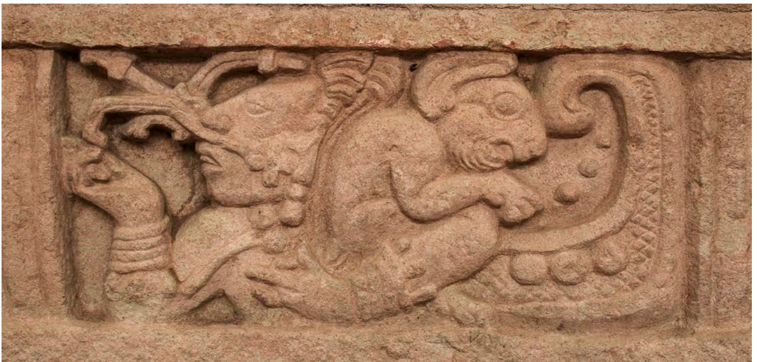
Lunar Maize God with rabbit and waterlily serpent nosepiece, portrayed on the Skyband Bench, Structure 8N-11, Copan.

This nuanced account explores Maya mythology through the lens of art, text, and culture. It offers an important reexamination of the mid-16th-century Popol Vuh, long considered an authoritative text, which is better understood as one among many crucial sources for the interpretation of ancient Maya art and myth. Using materials gathered across Mesoamerica, Oswaldo Chinchilla Mazariegos bridges the gap between written texts and artistic representations, identifying key mythical subjects and uncovering their variations in narratives and visual depictions. Central characters—including a secluded young goddess, a malevolent grandmother, a dead father, and the young gods who became the sun and the moon—are identified in pottery, sculpture, mural painting, and hieroglyphic inscriptions. Highlighting such previously overlooked topics as sexuality and generational struggles, this beautifully illustrated book paves the way for a new understanding of Maya myths and their lavish expression in ancient art.